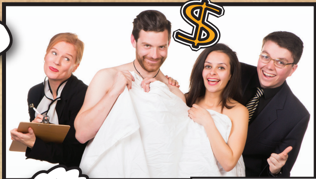
WE GET YOU MONEY!