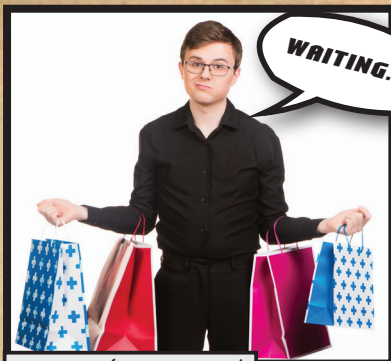
NOW WE'RE WHOLE!