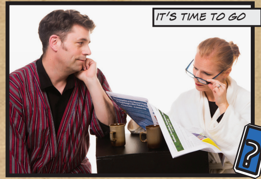
IT'S TIME TO GO