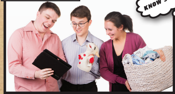
DO I KNOW YOU?