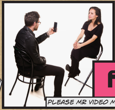
PLEASE MR VIDEO MAN!